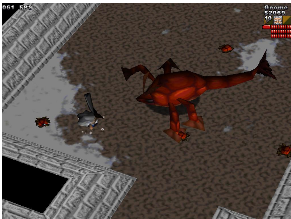
The fearsome rust monster